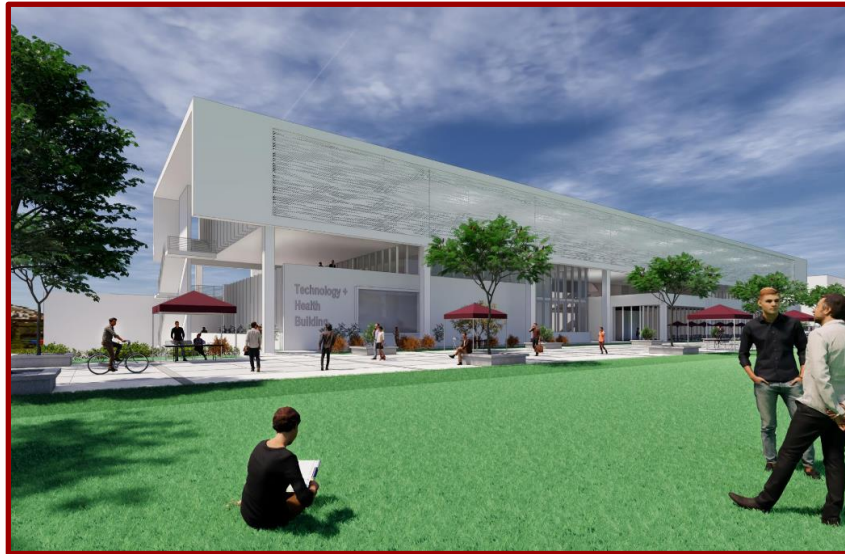
Conceptual rendering of Technology and Health Building