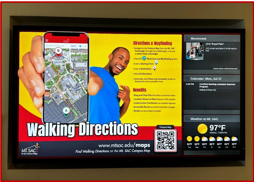
Campus Wayfinding Signage