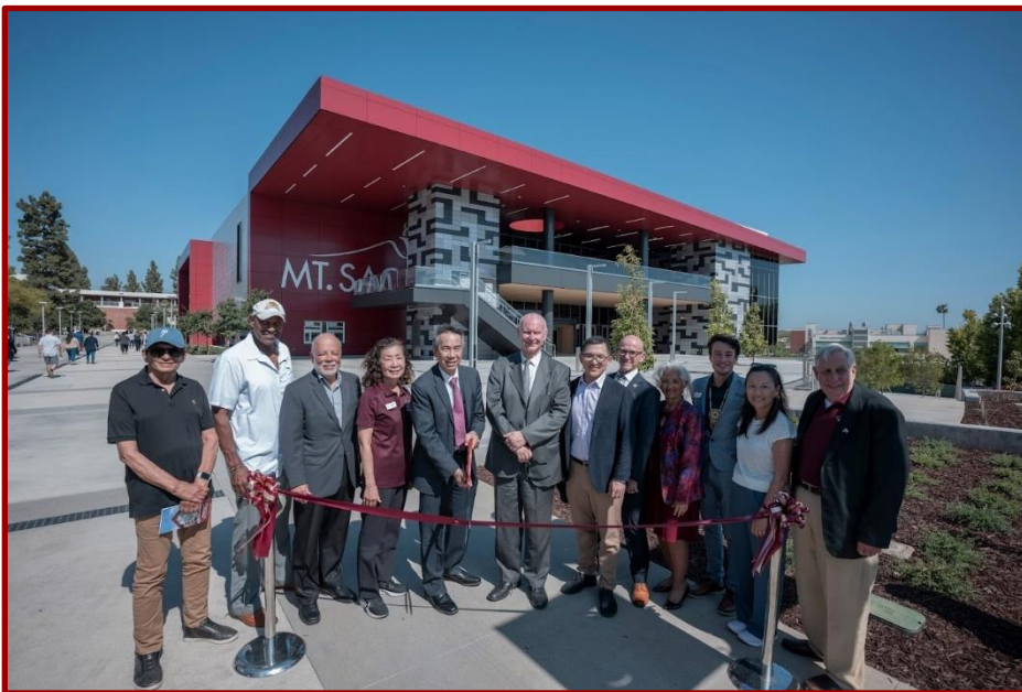
Student Center Ribbon-Cutting