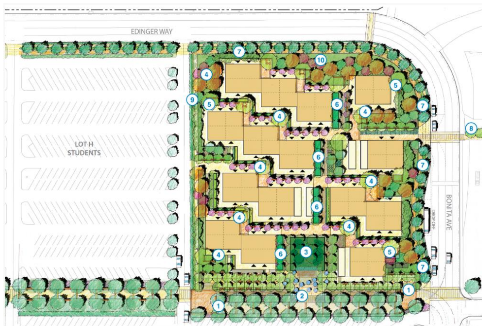
Phase 1 of Continuing Education and Instructional Village Project will provide up to 60 new classrooms at the northeast corner of Parking Lot H