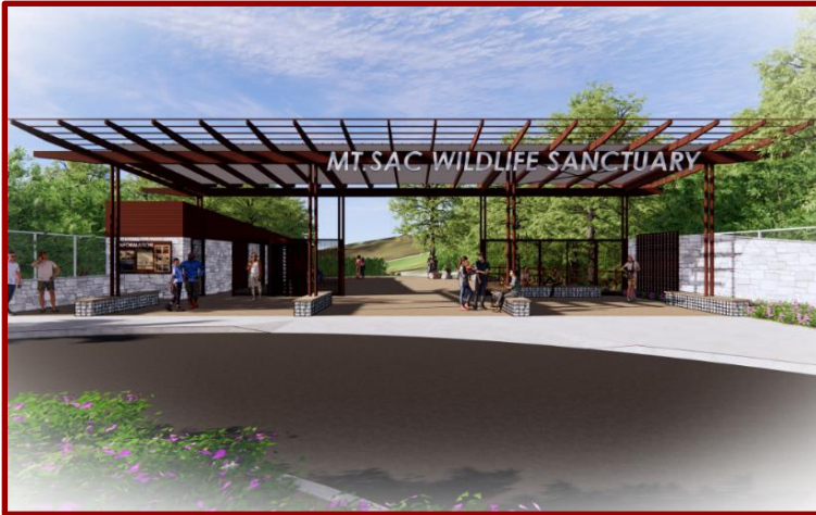
Conceptual rendering of Wildlife Sanctuary