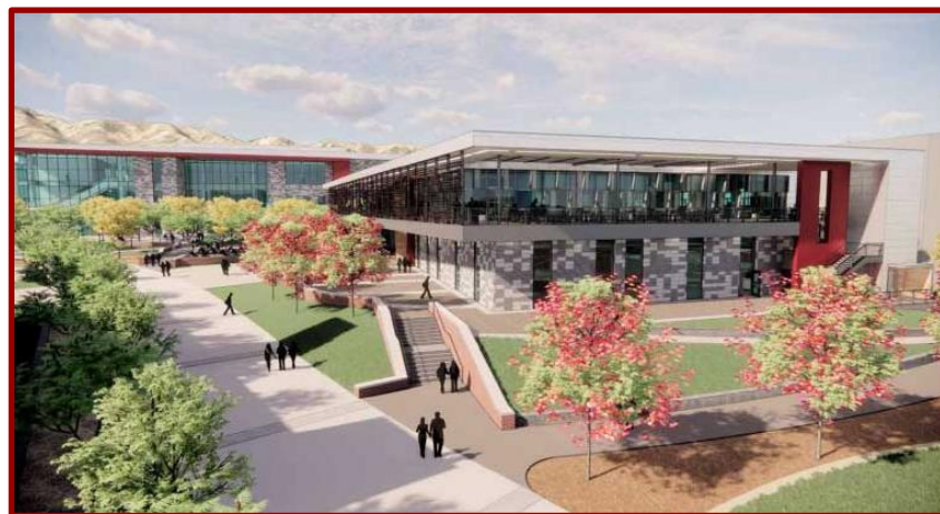
Conceptual rendering of Campus Store and Instructional Offices