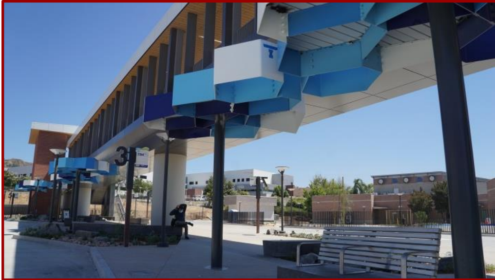
Mt. SAC Transit Center