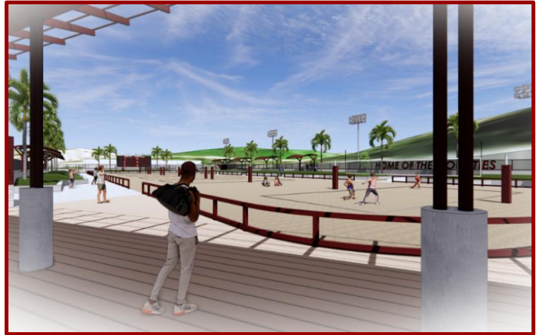
Conceptual rendering of Beach Volleyball Complex