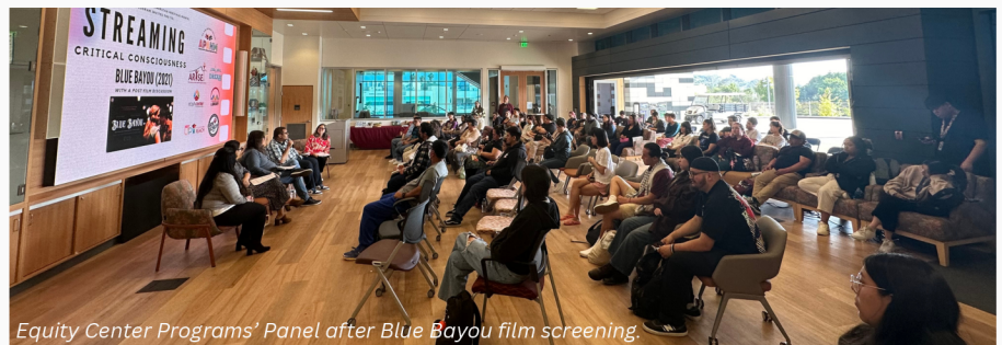
Equity Center Programs' Panel after Blue Bayou film screening.