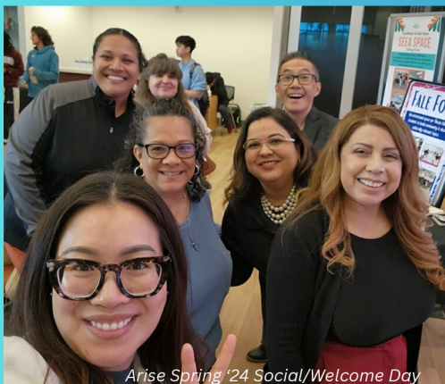
Arise Spring '24 Social/Welcome Day

Institutionalized so far: Director, Educational Advisor, Program Specialist II, and a Research Analyst (RIE)