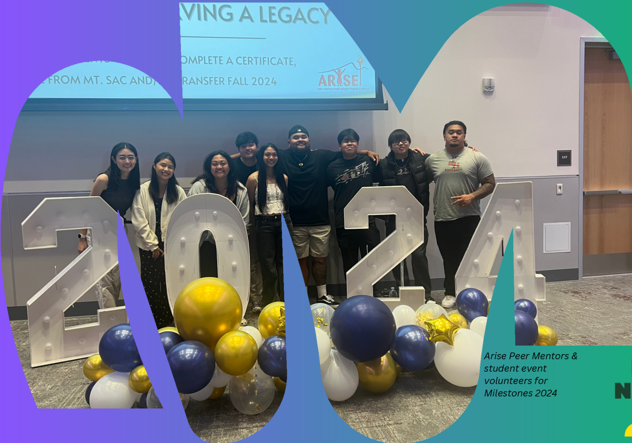
Arise Peer Mentors & student event volunteers for Milestones 2024