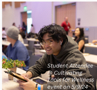
Student Attendee @ Cultivating Tools for Wellness event on 5/9/24