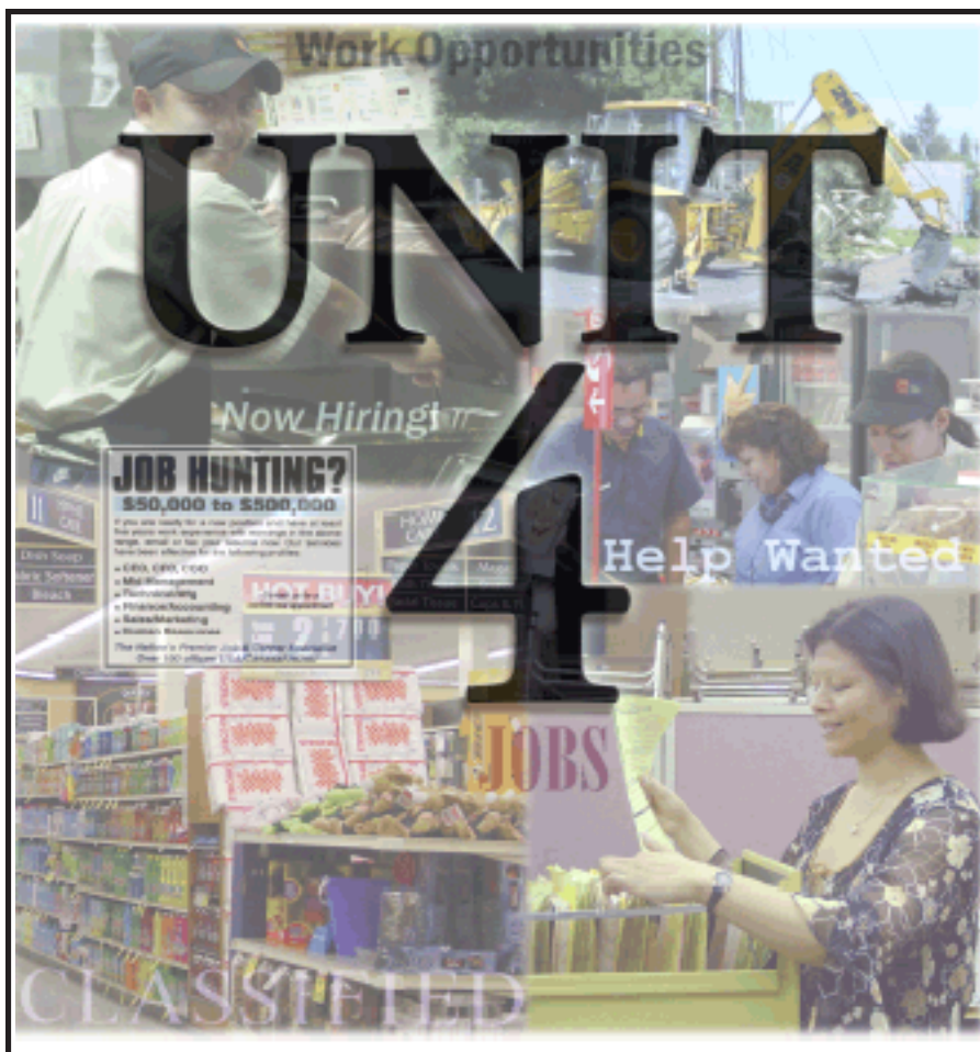
Table of Contents Level: Intermediate Low

Objective: Students will prepare for and participate in a job interview.