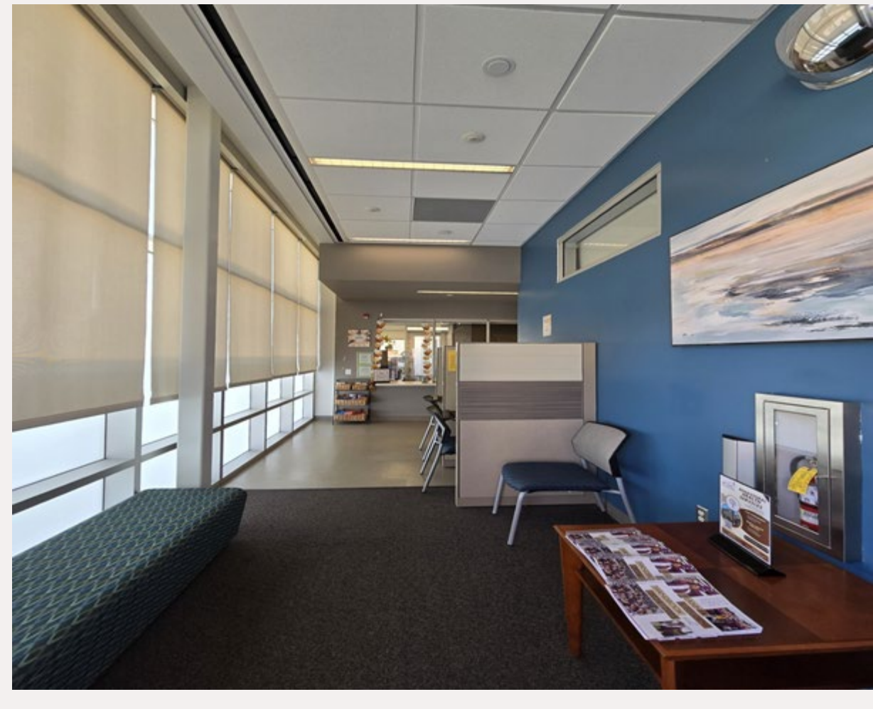
Entrance to BHS