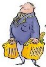
do the shopping