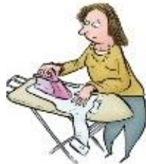
do the ironing