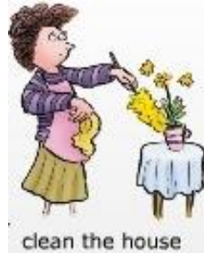
clean the house