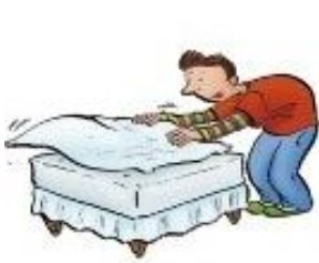
make the bed

Based on your list of things to do, add at what time you plan to do these things and write them out in full and complete sentences on the next page.