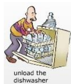
unload the dishwasher