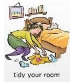
tidy your room