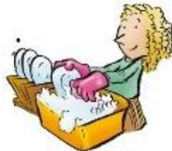
do the washing up