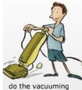
do the vacuuming