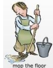
mop the floor