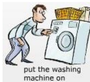
put the washing machine on