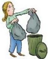
take the rubbish out