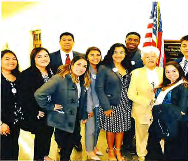
Policy Seminar; ACES students visiting the Capitol meeting with Representative Grace Napolitano, March 2018

Highlights of the Policy Seminar experience in March 2018: