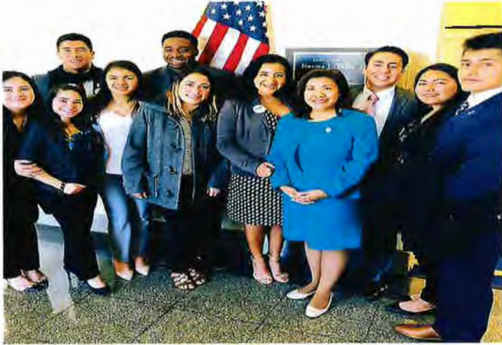
Policy Seminar; ACES students visiting the Capitol meeting with Representative Norma Torres, March, 2018