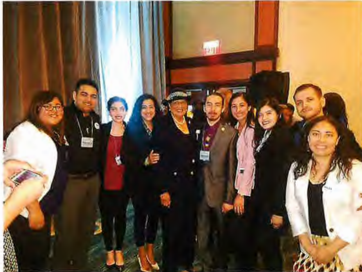
Policy Seminar; ACES students visiting the Capitol meeting with Representative Gwen Moore, March 2017