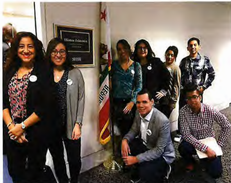
Policy Seminar; ACES students visiting the Capitol meeting with Senator Dianne Feinstein, March 2016