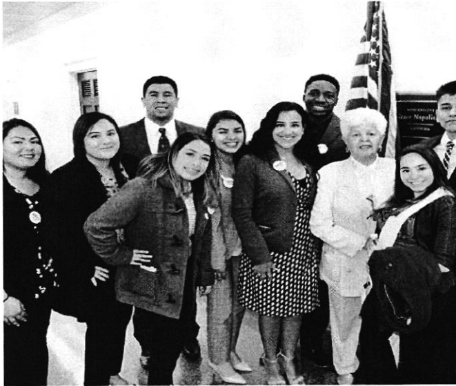
Meeting with Representative Grace Napolitano, March 2018