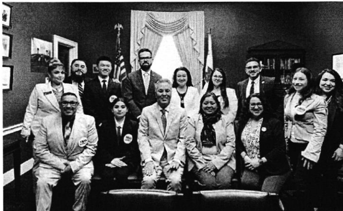
Meeting with Rep Mark Takano, 39 th District