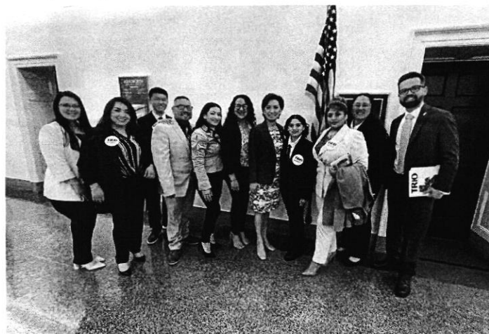
Meeting with Rep Young Kim, 40 th District