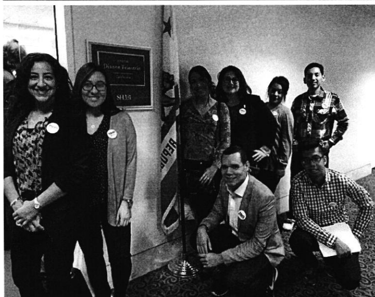
Meeting with Senator Dianne Feinstein, March 2016