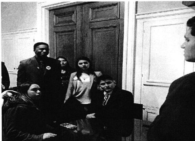
Meeting with Representative Edward Royce's Legislative Aide, March, 2018