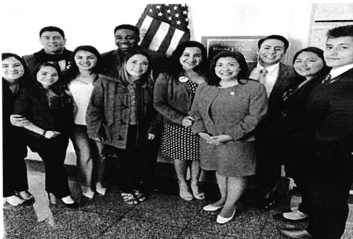
Policy Seminar; Meeting with Representative Norma Torres, March 2018