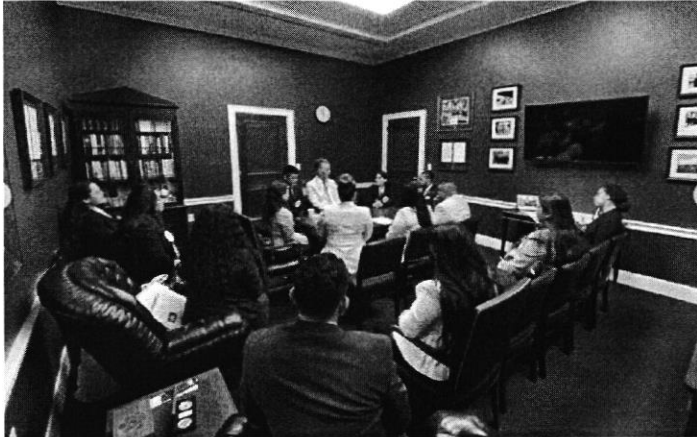
Meeting with Rep Mark Takano, 39 th District