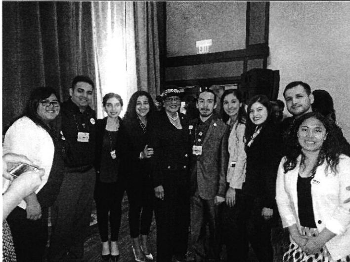
Meeting with Representative Gwen Moore, March 2017